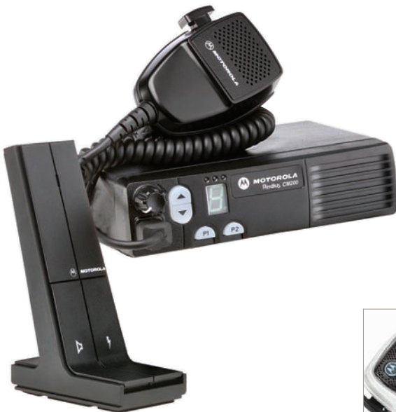
Compact microphone: HMN3596 Desktop microphone: RMN5068

For a detailed listing of all Motorola Original® accessories* available for your CM200 or CM300 mobile radio, see the Commercial Tier Accessories Catalog (RC-3-1008).